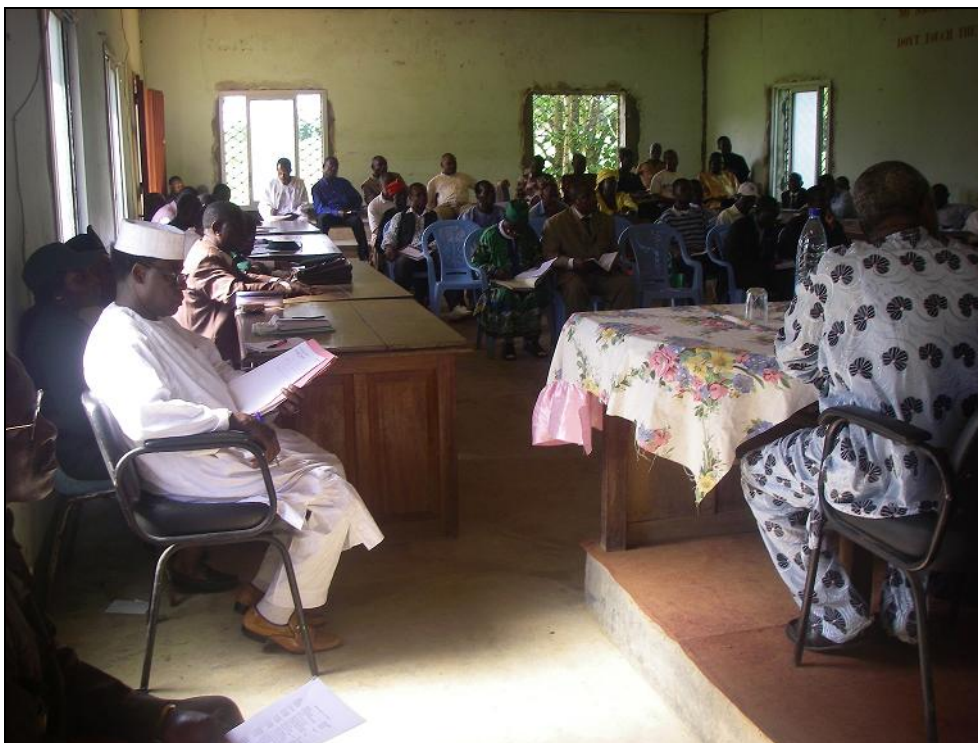
Plate 6: Participants in the heart of discussions.