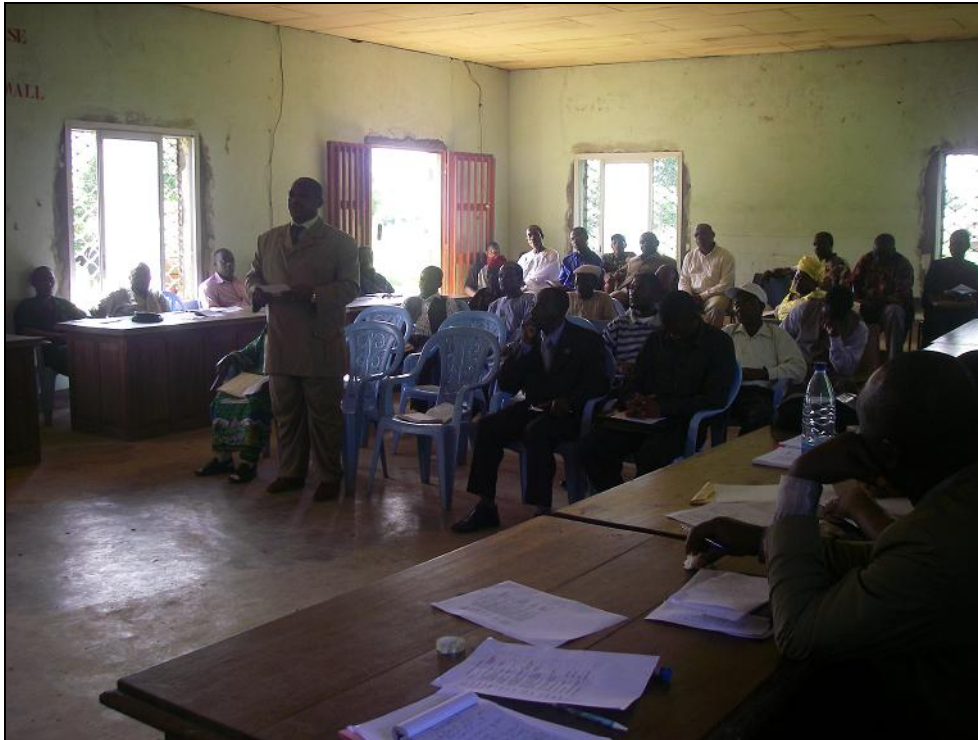
Plate 5: An External elite contribute on the way forward during the workshop.